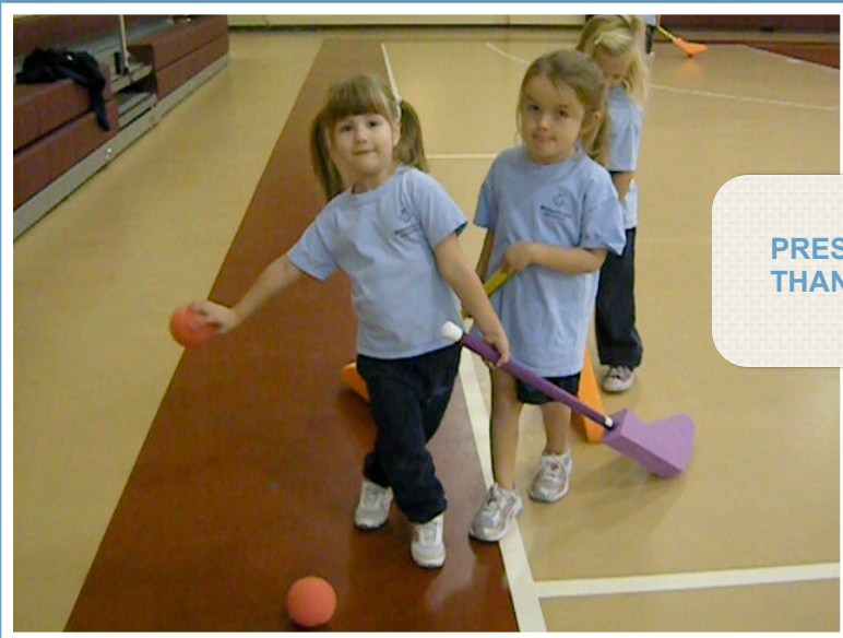
PRESCHOOL ENJOYS NERF HOCKEY THANKS TO THE EASOP FAMILY'S DONATION