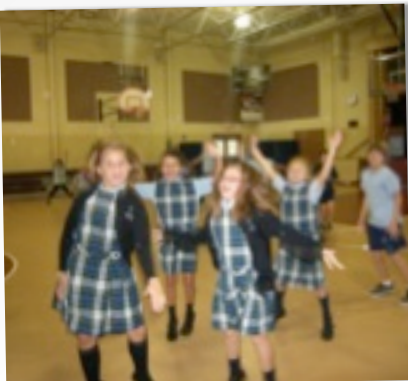
JUMPING JACKS FOR MRS. OBAMA'S CHALLENGE